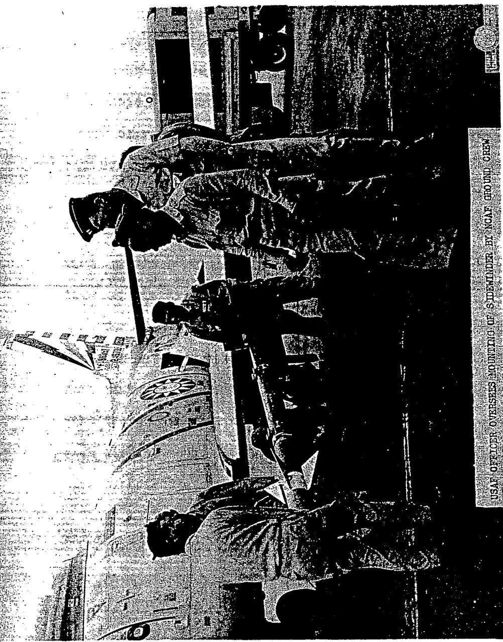
USAF OFFICERS OVERSEES MOUNTING OF SIDEWINDER BY NCAF GROUND CREW