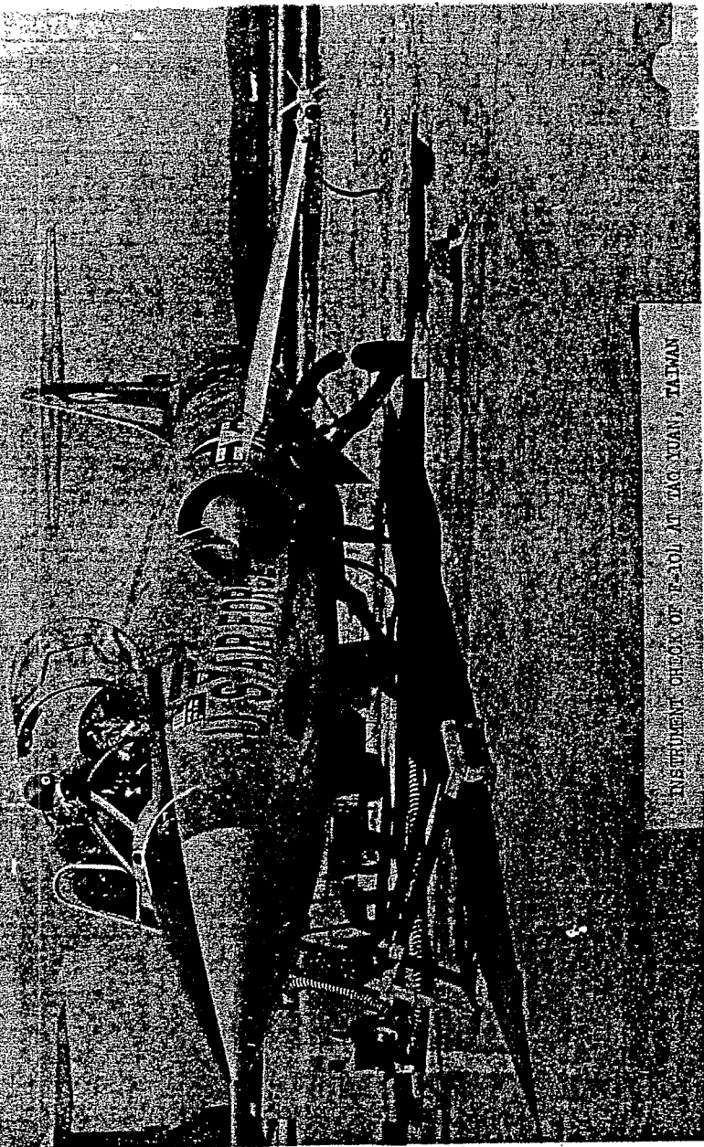
INSTRUMENT CHECK OF F-101 AT TAIYUAN, TAIWAN